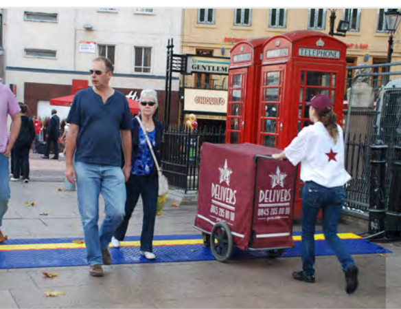
PICTURED: GD5X125-ADA IN USE (LEFT) HEAVY DUTY ACCESSIBILITY RAMPS IN USE (TOP)

Checkers' Linebacker Cable Management offers the most extensive line of high performance cable/hose protection products in the world. These durable cable protection systems provide a safer method of passage for pedestrian traffic, vehicles and heavy duty equipment while protecting valuable electrical cables, cords and hose lines from damage.